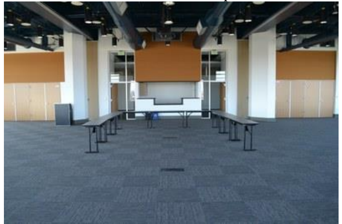
Panoramic Center – conference space