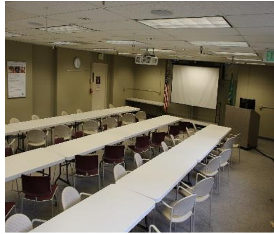
PacMed Ground West 1