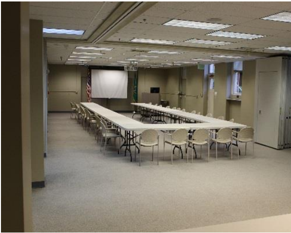
PacMed Ground West 1 & 2