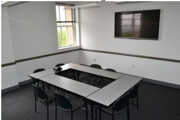
Suite 820 – small meeting room