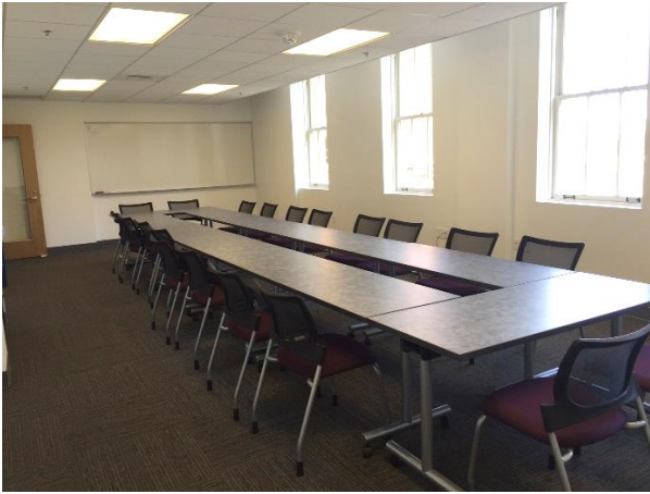
Suite 180 – meeting room 1 st floor East