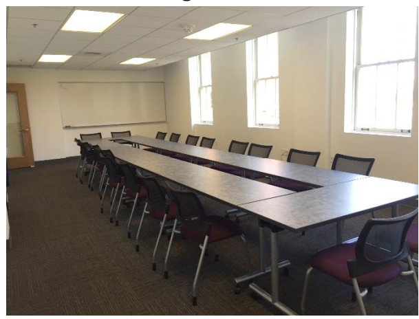
PacMed Ground West 1 & 2

Suite 180 – meeting room 1<sup>st</sup> floor East